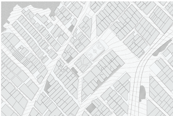
SITE PLAN AND BARRIO