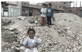
PHOTOGRAPH OF THE SITE BEFORE THE PARK