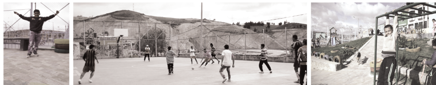
PHOTOGRAPHS OF THE INHABITANTS USING THE PARK