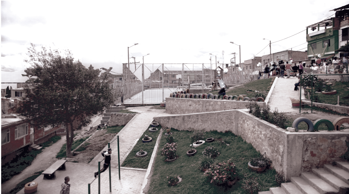
PHOTOGRAPH OF THE PROJECT